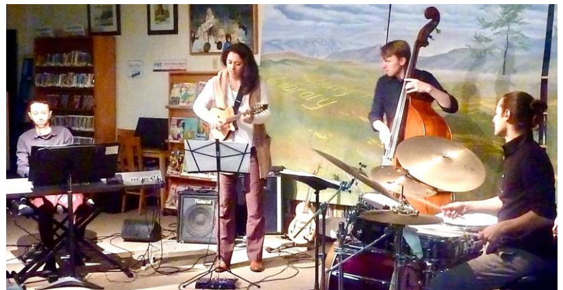
Jazz artists sharing their talents at the library.