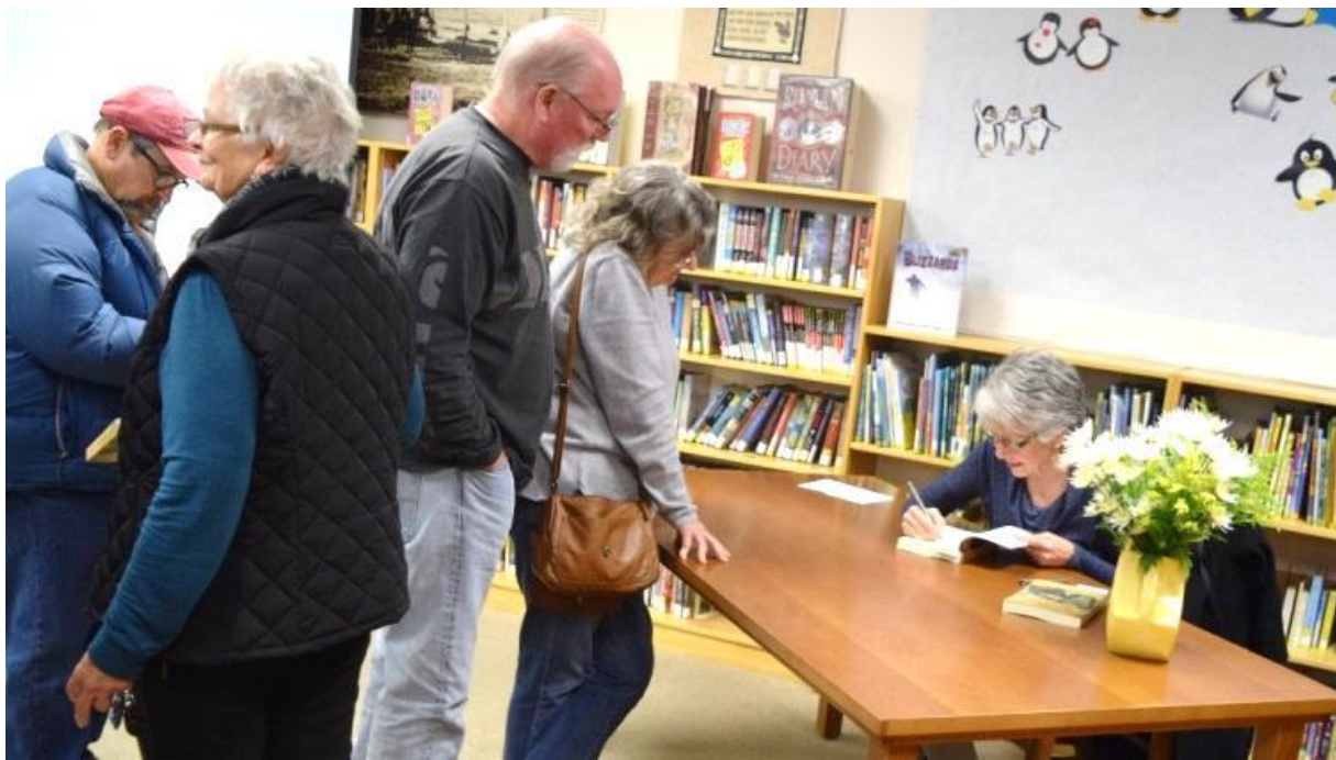
Books were available at the launch, and many guests were happy to get a personalized copy!