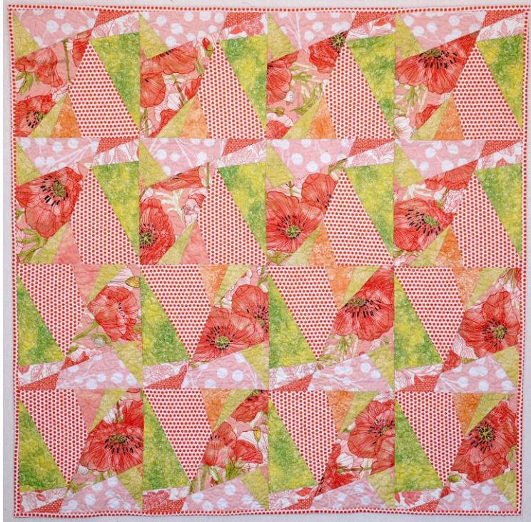
This quilt, titled "Popping Poppies" will be raffled this spring