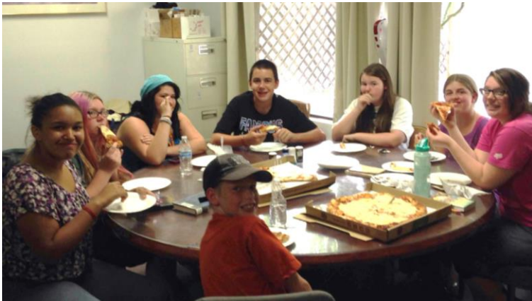
The TAG hard at work...having fun!